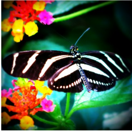
Zebra Longwing Butterfly £85