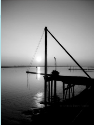
Sundown in Burnham