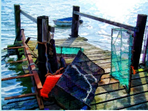
Crabbing in Burnham

If you prefer an unframed print or would like to see more of my work please visit my website www.crouchriverstudio.com