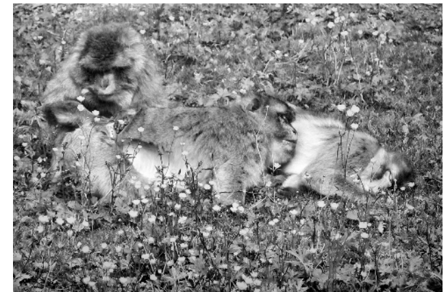
Sunday Afternoon £50