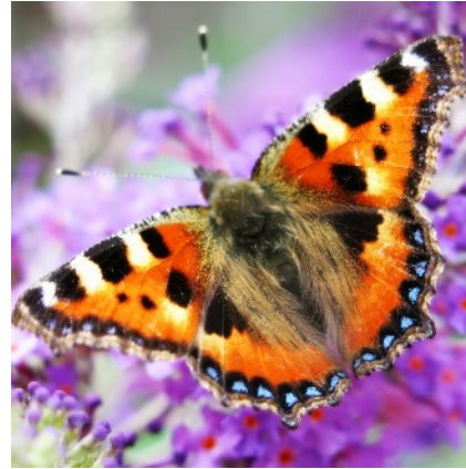
Small Tortoiseshell Butterfly £85