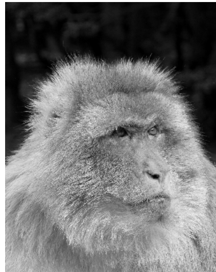
Barbary Macaque I £50